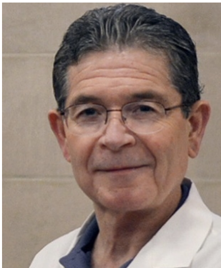
Harold G. Koenig

For treatment of MI Koenig introduces a therapy schedule with SICPT containing 12 sessions. The basic model can be adapted according to the individual religious background of the person. Patients shall become aware of their own spiritual resources and learn an empathic encounter with their inner conflicts instead of blaming themselves. They shall deal with the meaning of guilt and forgiveness and succeed in helpful new appraisals. In order to internalize these they shall cultivate a closer connection to their religious community, if this is a problem, and a deeper personal spiritual life.