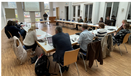
Note: aef-workshop in Bad Liebenzell Germany